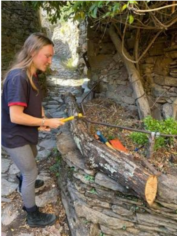
Old trunk, now new Mezzanine support beam.