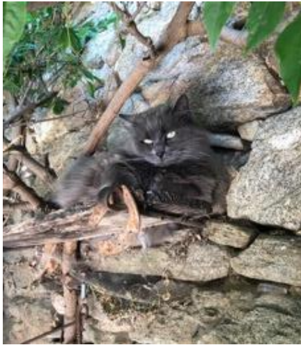
Nushka as nonchalant as ever.