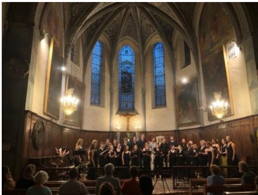
The Académie de Musique de Chambre de Bardou at their concert in Saint-Chinian