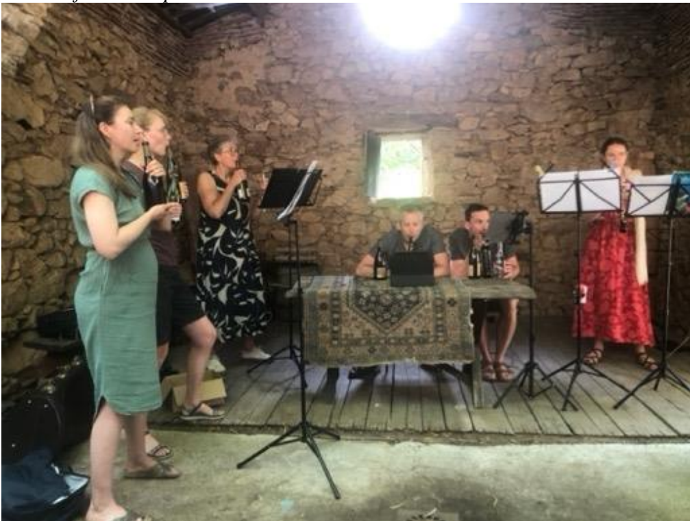
July Sinfonietta's glass bottle private concert in the Theatrum