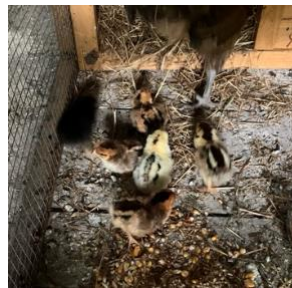
Rolland brought us chickens who have hatched some very cute chicks The tiniest Salamander yet spotted in Bardou. Pun intended.