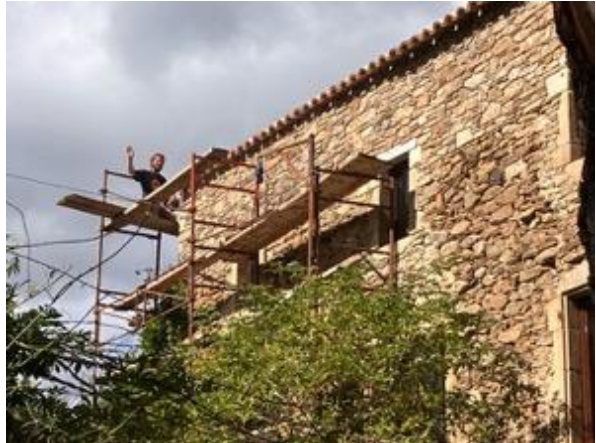
The master house got a new roof. Spot the before and after.