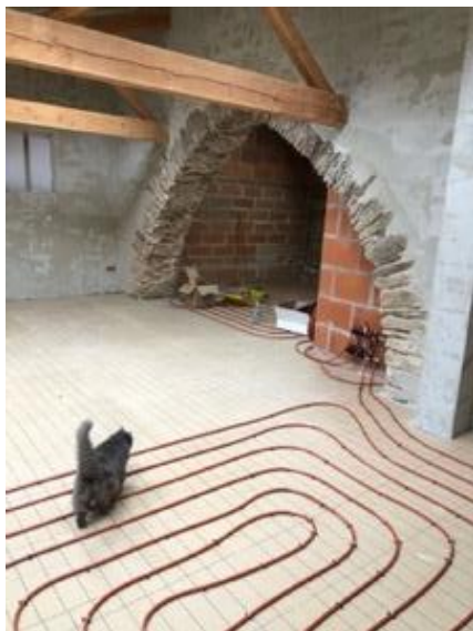
Nuschka closely inspecting the underfloor heating work.