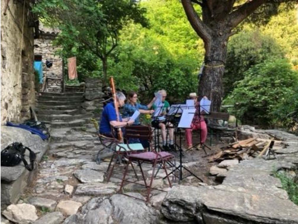
June Sinfonietta's private concert in Bardou