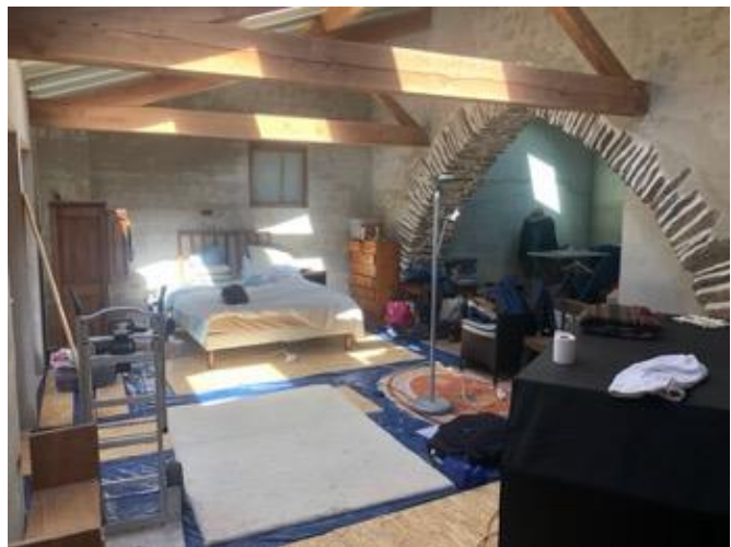
Our future living-room, currently masquerading as our bedroom.